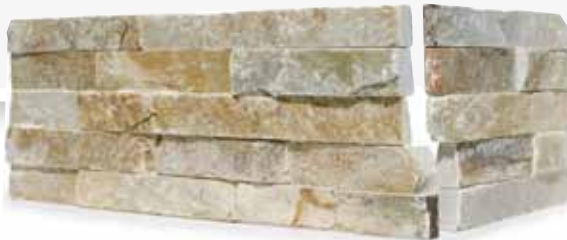
Sierra Shadowstone Corner