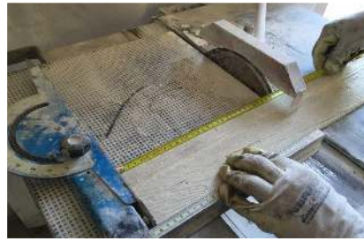
5. Cut down the individual pieces from step 4 to fit the gaps you measured in step 3.