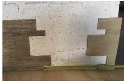
2. Work from left to right by installing Antique Wood panels until the gap between the corner pieces and full panels is less than a full panel.