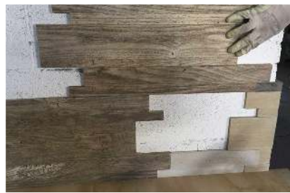
8. By alternating the installation on your wall, starting one row on the left and the next row on the right, the installer ensures that the rows are always slightly offset, thus providing seamless final installation.

For additional information contact us at www.realstone.com | 1.866.698.5066