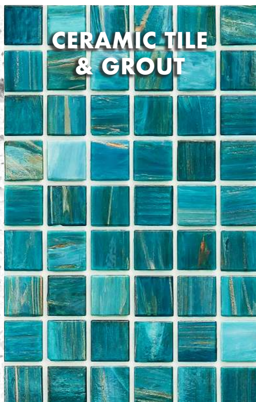
CERAMIC TILE & GROUT