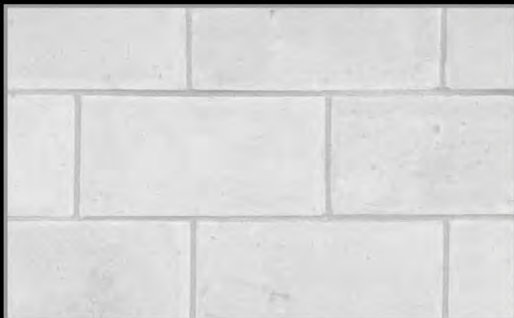
Arctic Limestone Wall Tile