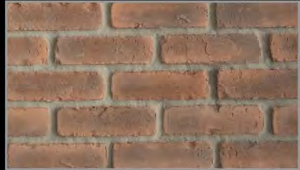
Boston Edison Antique