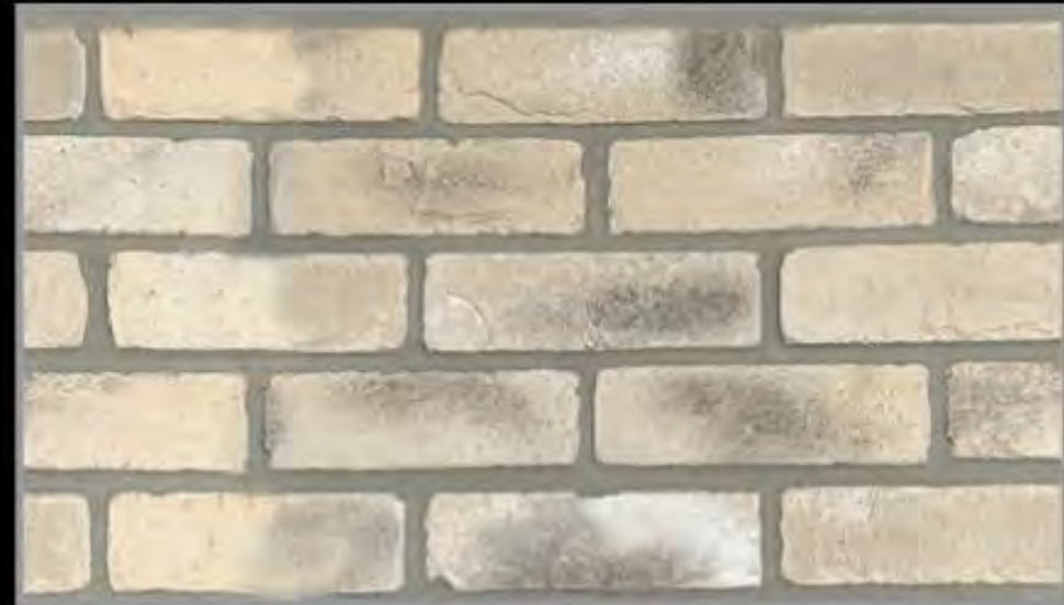
River Town Antique