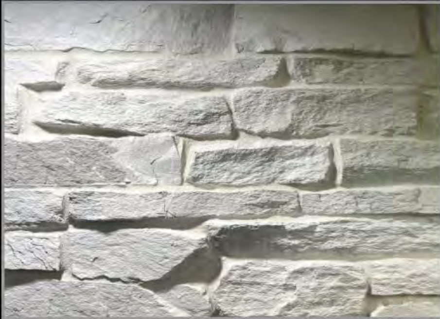
Arctic Granite Faux Stone

realstone SYSTEMS ™ Inspiring. Timeless. Enduring.