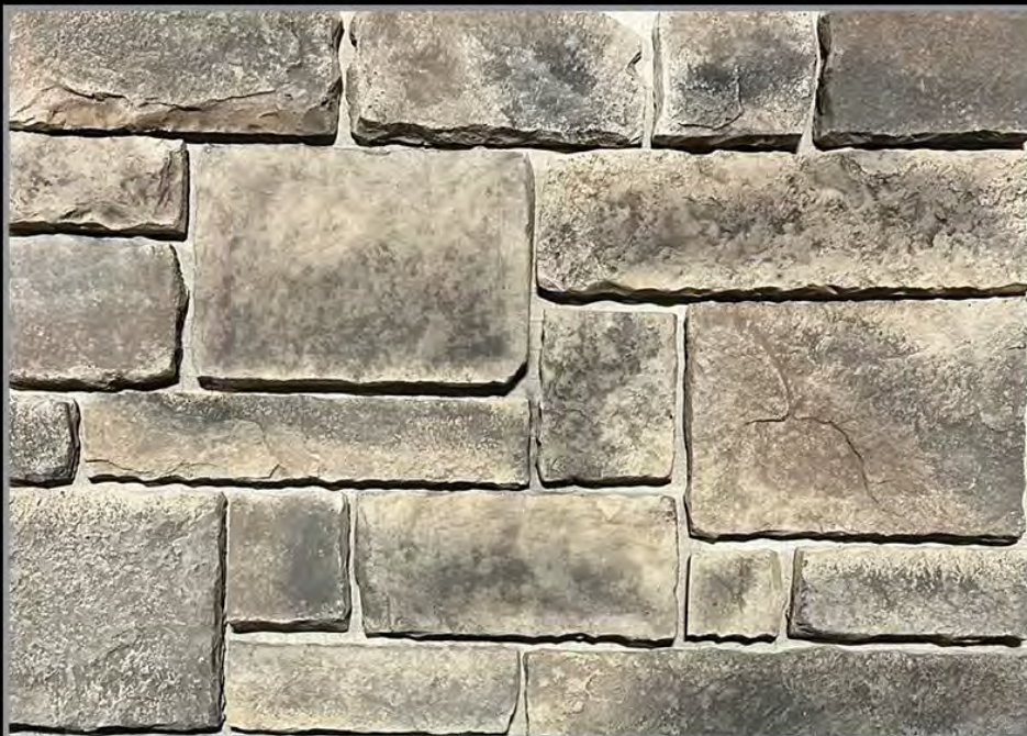
Boulder Cobble Faux Stone