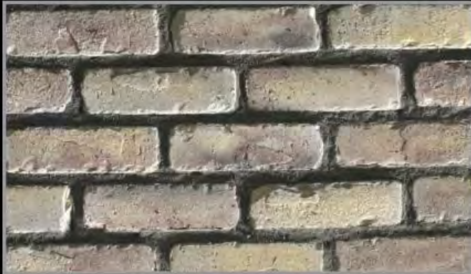
Palmer Park Antique