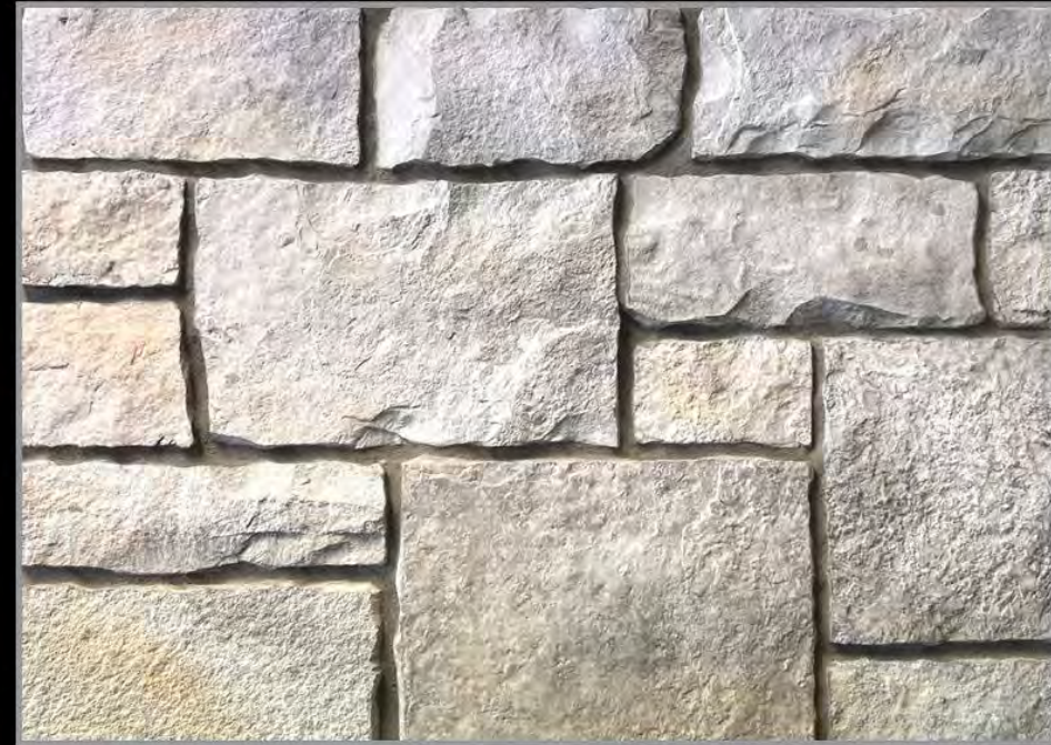
Napa Cobble Faux Stone