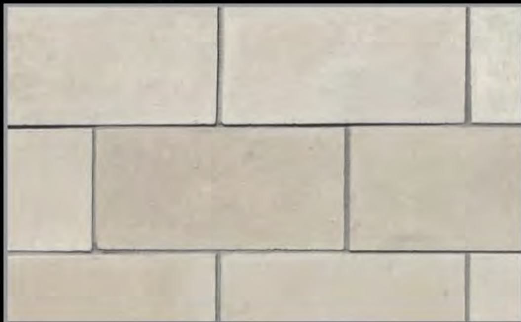
Buff Limestone Wall Tile

realstone SYSTEMS ™ Inspiring. Timeless. Enduring.