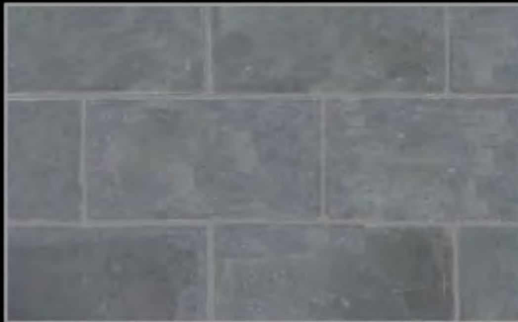
Grey Limestone Wall Tile