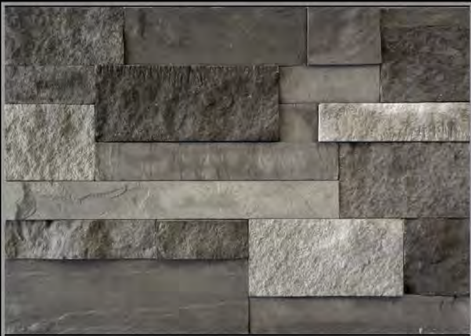
Midnight Precision Faux Stone