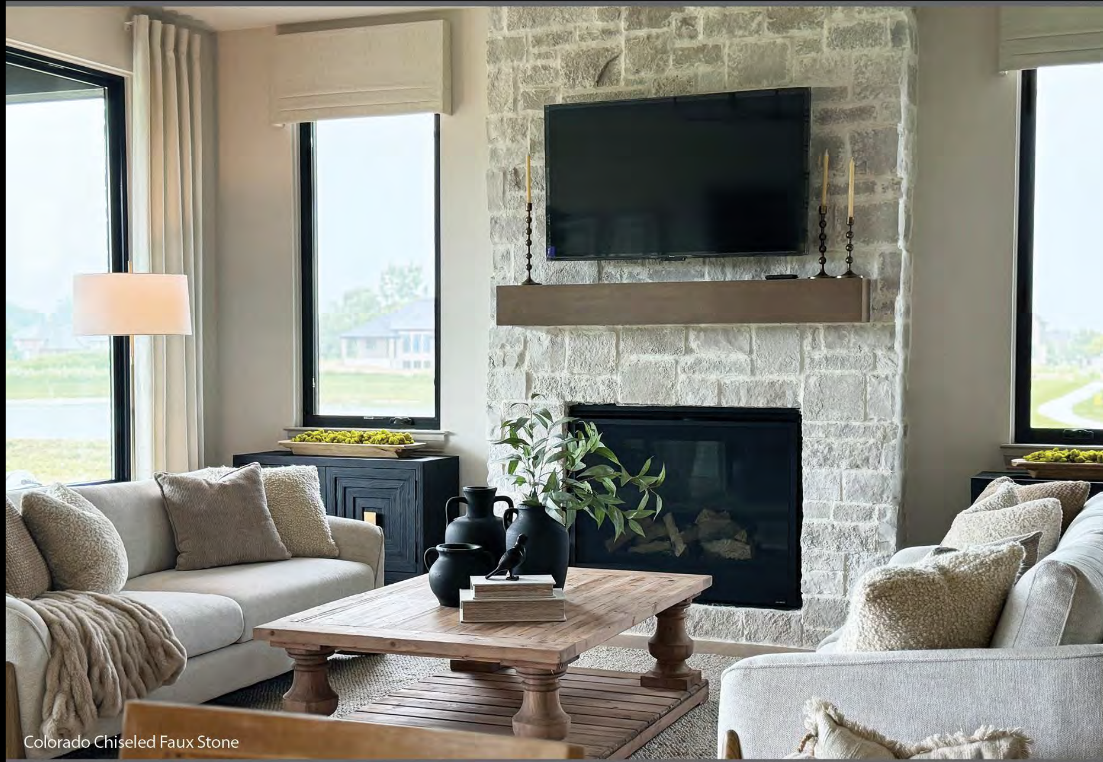
Colorado Chiseled Faux Stone