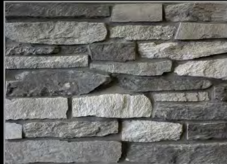
Midnight Granite Faux Stone