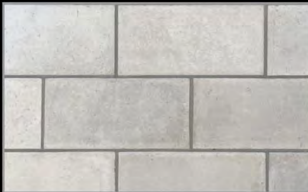
Greige Limestone Wall Tile