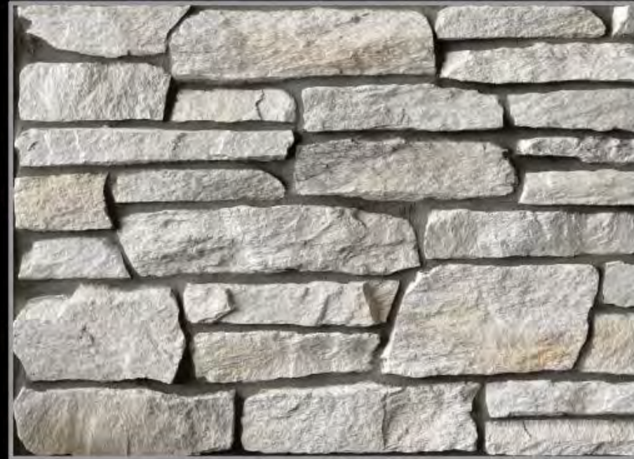
Colorado Granite Faux Stone