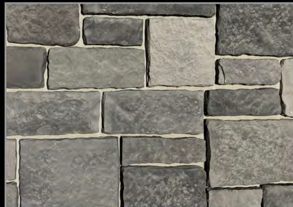
Midnight Cobble Faux Stone