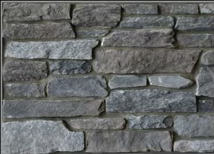
Carbon Granite Faux Stone