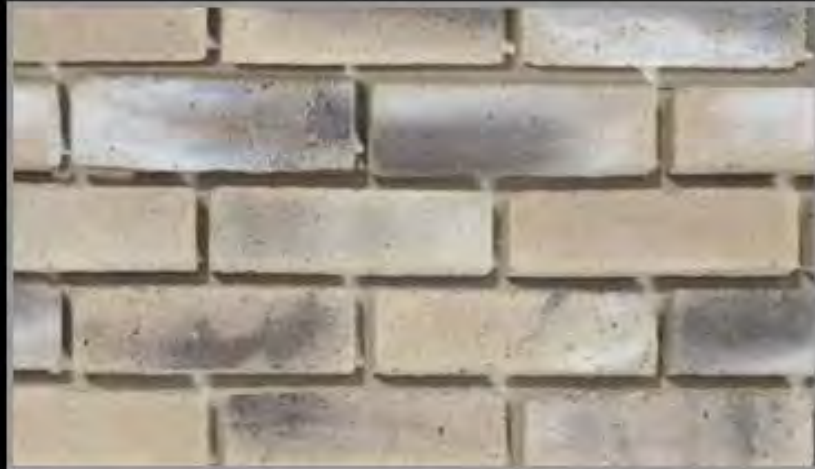
River Town Standard