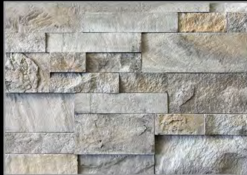
Napa Precision Faux Stone