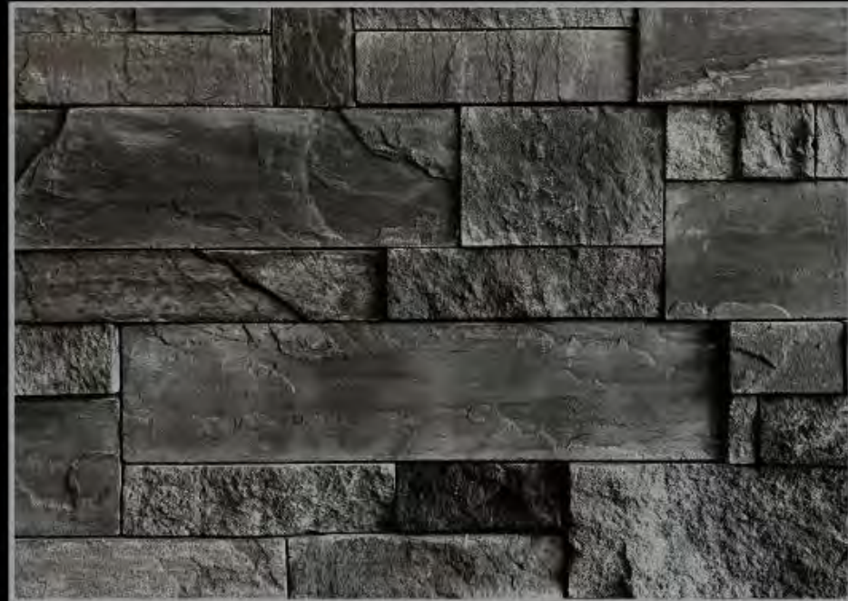
Onyx Precision Faux Stone