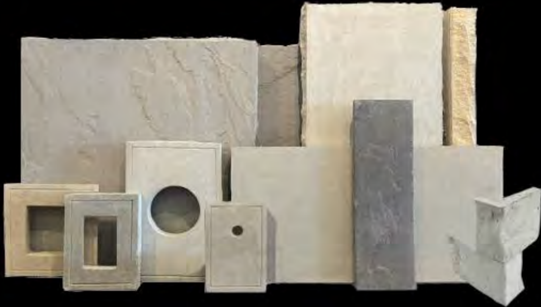
Hearths, Sills, Wall Caps, Boxes, Corners