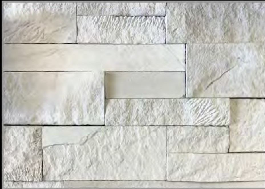
Arctic Precision Faux Stone

realstone SYSTEMS ™ Inspiring. Timeless. Enduring.