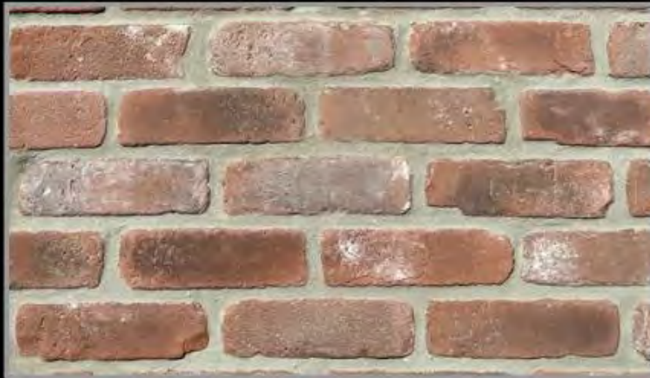
Cork Town Antique