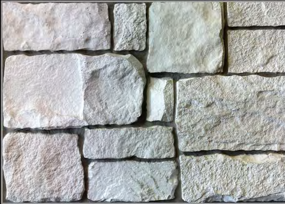
Arctic Cobble Faux Stone

realstone SYSTEMS ™ Inspiring. Timeless. Enduring.